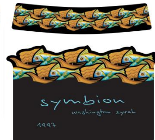
TLMI "BEST OF SHOW" TLMI "BEST OF WORLD"