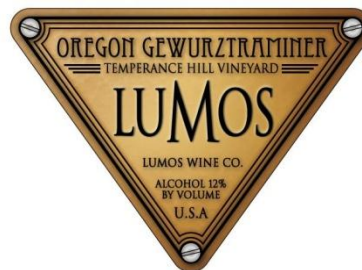
TLMI "BEST OF WORLD" HONORABLE MENTION TLMI 1 st PLACE Wine & Spirits, Color Process